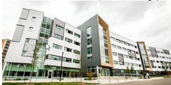
Thelma Chalifoux Hall (Athletes Village):